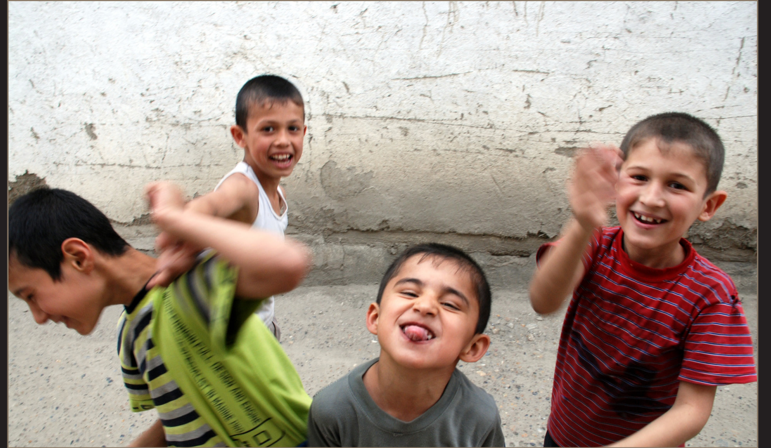
Play with the local kids.