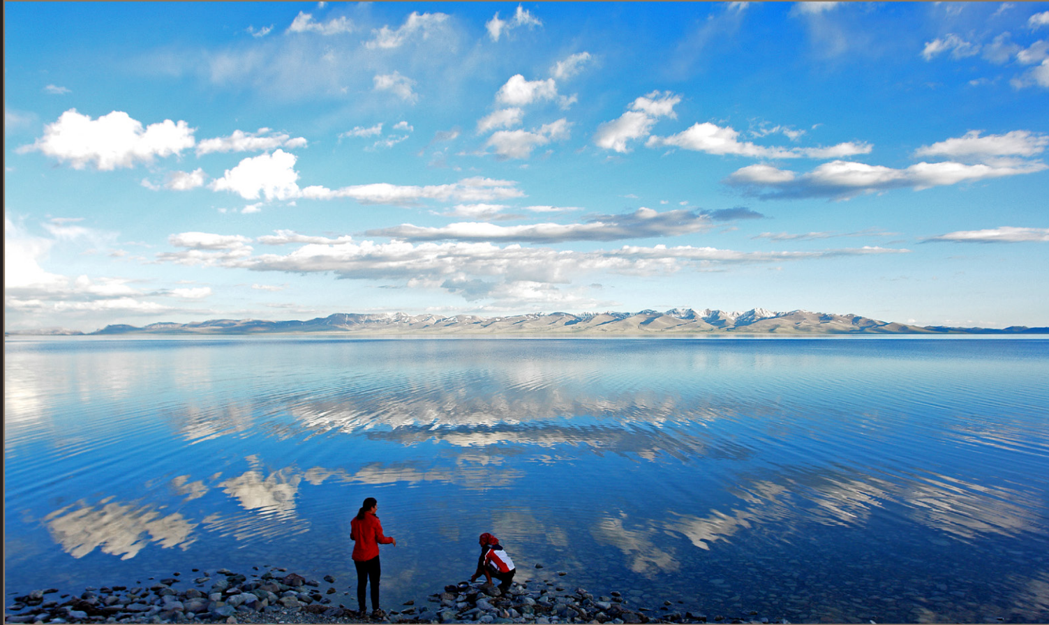
Have lunch by a lake.